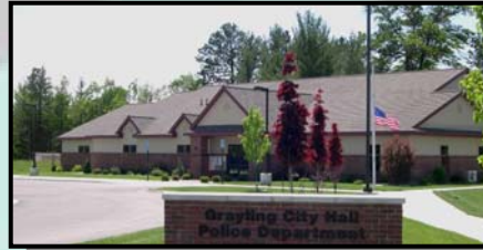
Grayling City Hall/Police Station