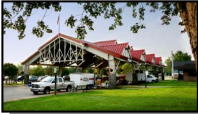
Pavilion on Court, Gaylord

Since 1996, Bradley J. Butcher & Associates, PC has been helping our neighbors plan for the future, whether there's an immediate need for a new facility or a long range vision of community-wide improvements.