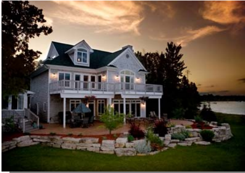
Lake Charlevoix, Horton Bay, MI