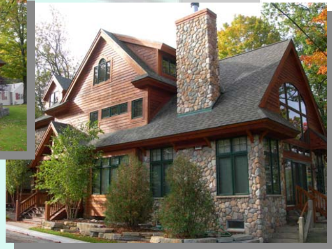
Otsego Lake Gaylord, MI