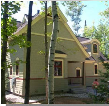
Twin Lakes Cottage Cheboygan, MI