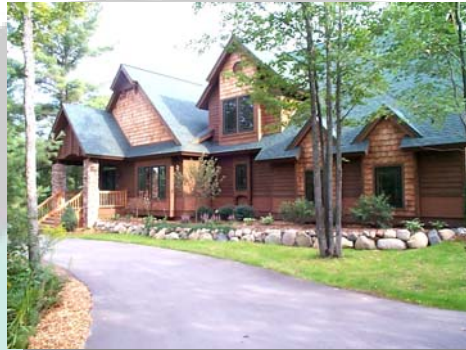
Loon Golf Club, Gaylord, MI